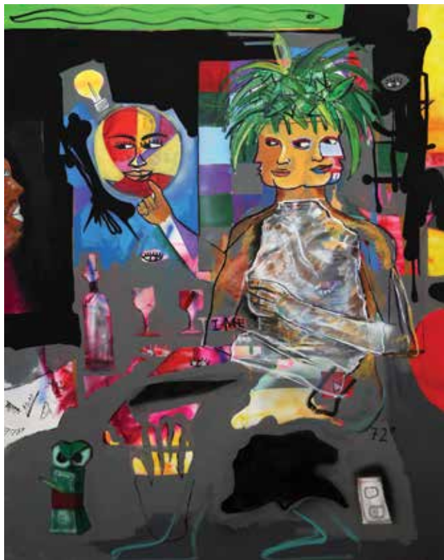
Erick Antonio Benitez, Things I Imagined , 2019. Acrylic, airbrush, charcoal and ink in wooden panel, 60 x 48 in.