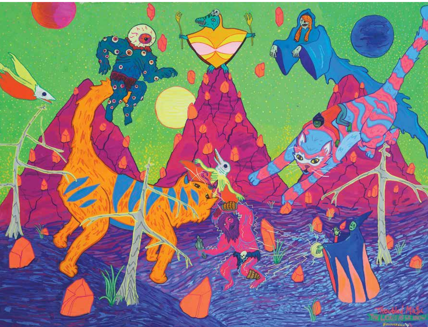
Bonner Sale, Troubled Magic: All We Know , 2019. Gouache on paper, 22 x 30 in.