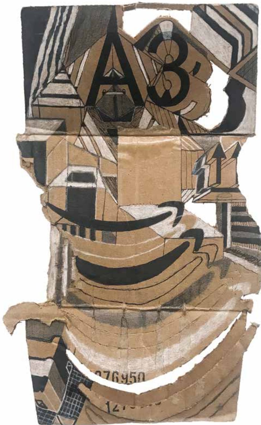
Nieko McDaniel, Untitled Landscape #7 , 2019. Archival pen, cardboard, graphite, Sharpie, white oil pencil, 11.25 x 9 x 1.5 in.