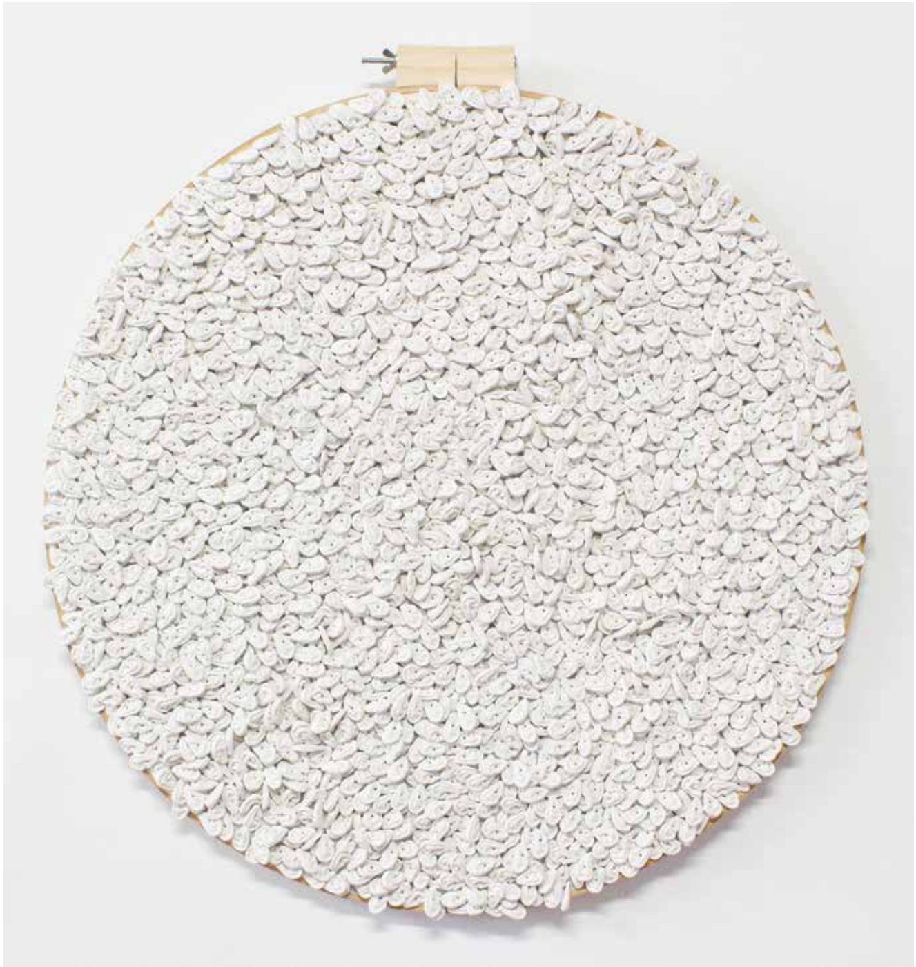
Sara Dittrich, Variations on Listening #1 , 2017. Polymer clay, embroidery hoop, fabric, thread, 25 x 23 x 1.5 in.

Opposite: Variations on Listening #1 (detail), 2017. Polymer clay, embroidery hoop, fabric, thread, 25 x 23 x 1.5 in.