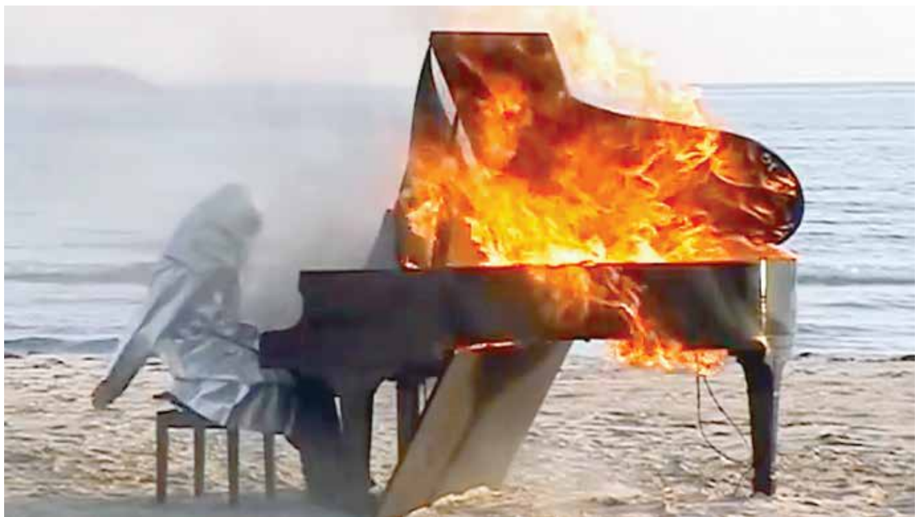
From top: Paul Blakeslee, Another Casualty of the Seduction of Art (still), 2020. Color and black & white video with original music, 2 min. 44 sec.; I Get Petrified (still), 2020. Color and black & white video with original music, 3 min. 33 sec.