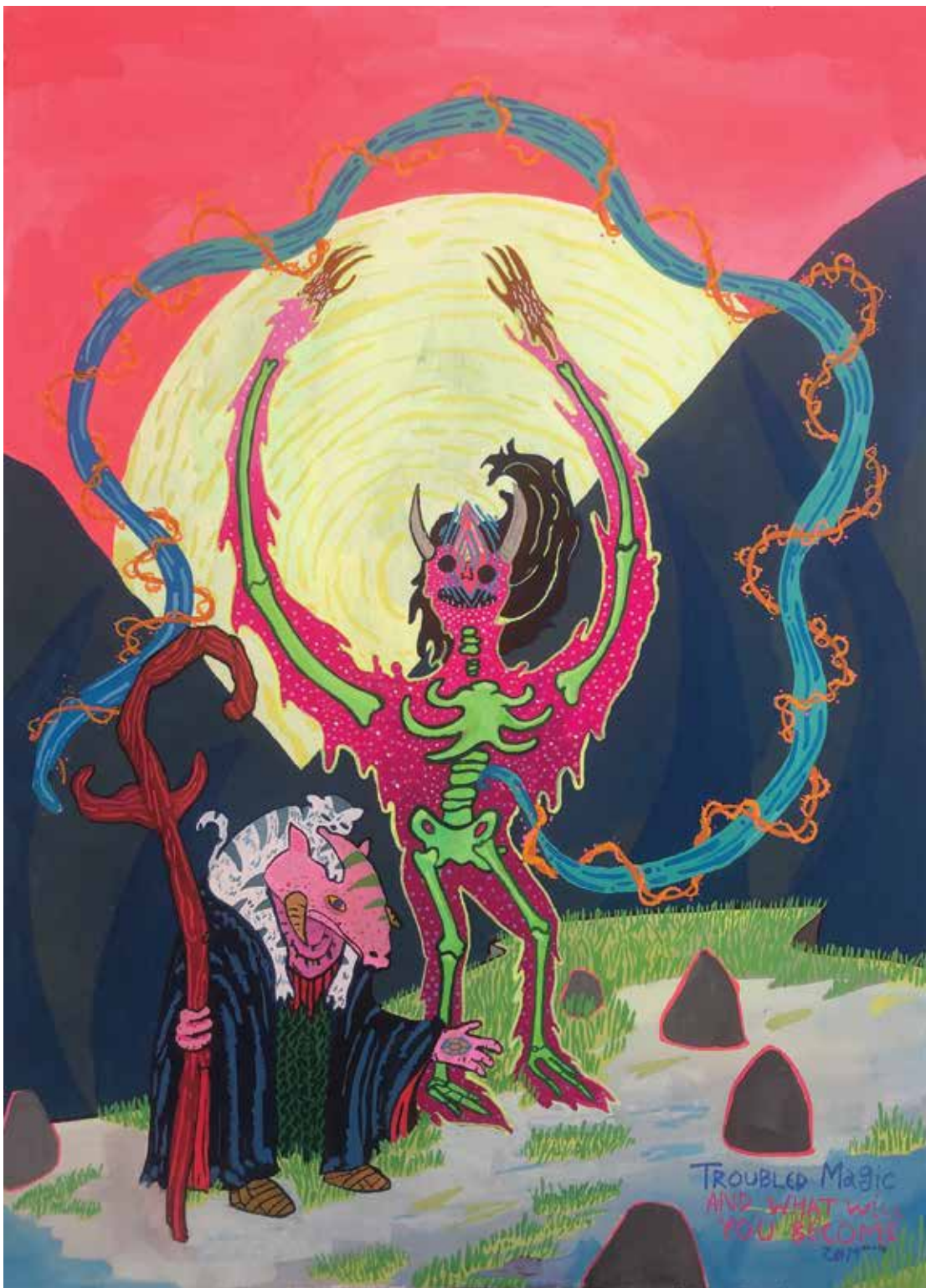
Bonner Sale, Troubled Magic: Look What you Have Become , 2019. Gouache on paper, 15 x 11 in.