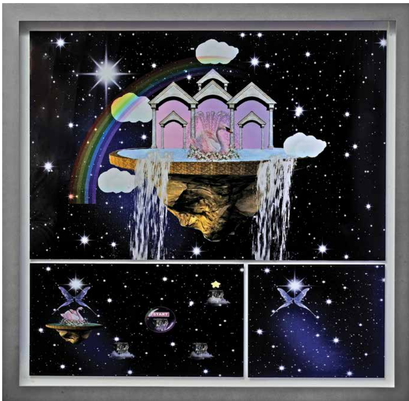
Hillary Rochon, Swan , 2019. Digital collage, 25 x 16 in.