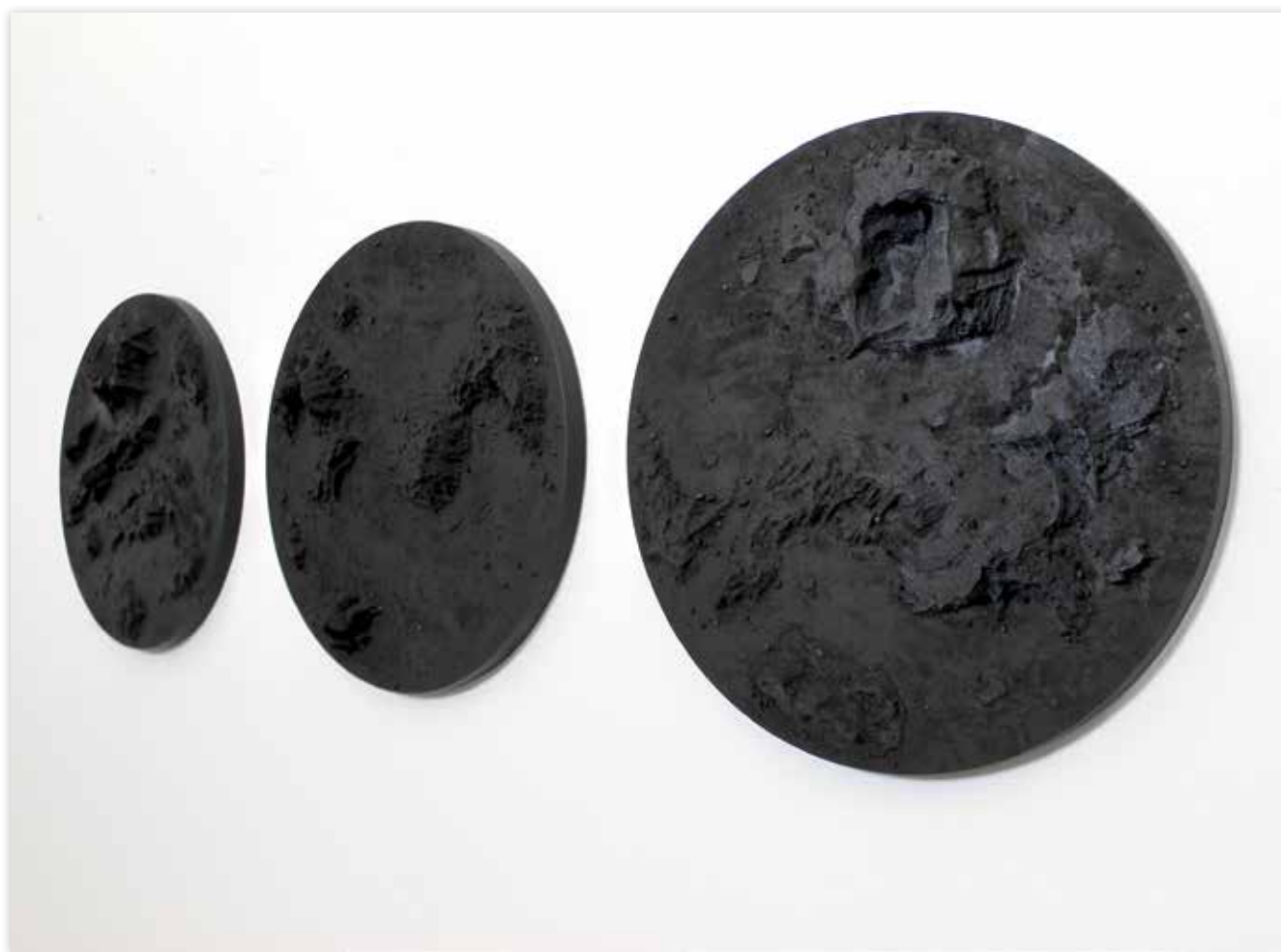
Caroline Hatfield, Terraform 001 , Terraform 002 , Terraform 003 , 2018. Laser cut layered tar paper, charcoal on panel, 15 x 15 x 2.5 in. (each).