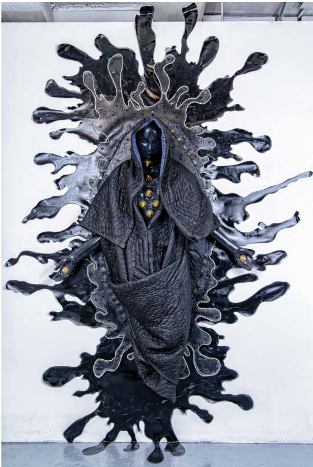
Terence Nicholson, Our Lady of Perpetual Servitude , 2018. Mixed media, 96 x 64 in.