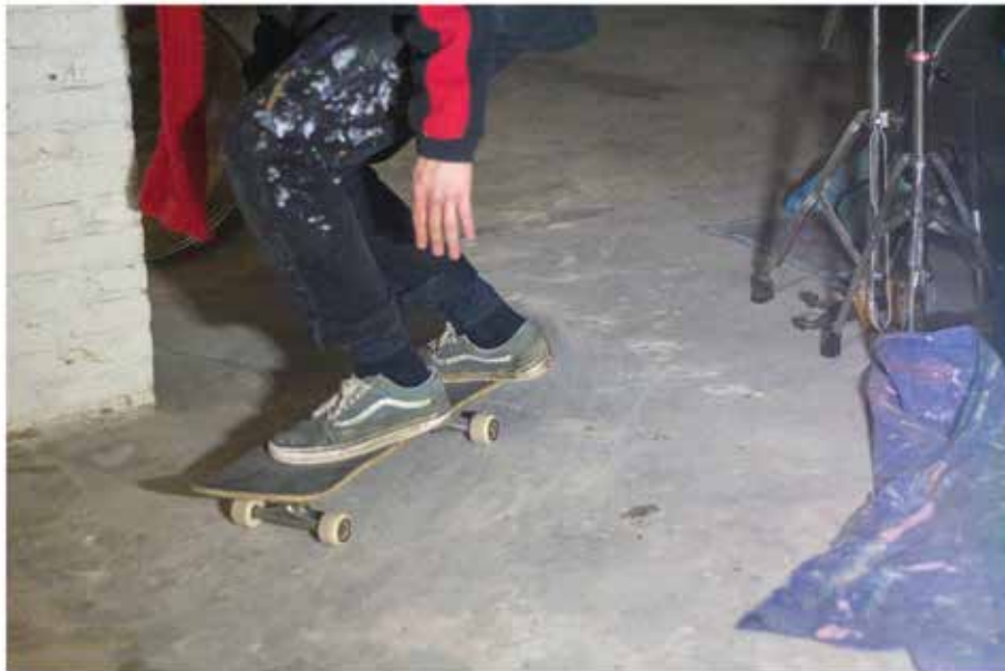
MichaelAngelo Rodriguez, Careful with the big painting , 2019. Archival pigment print, 13 x 19 in.