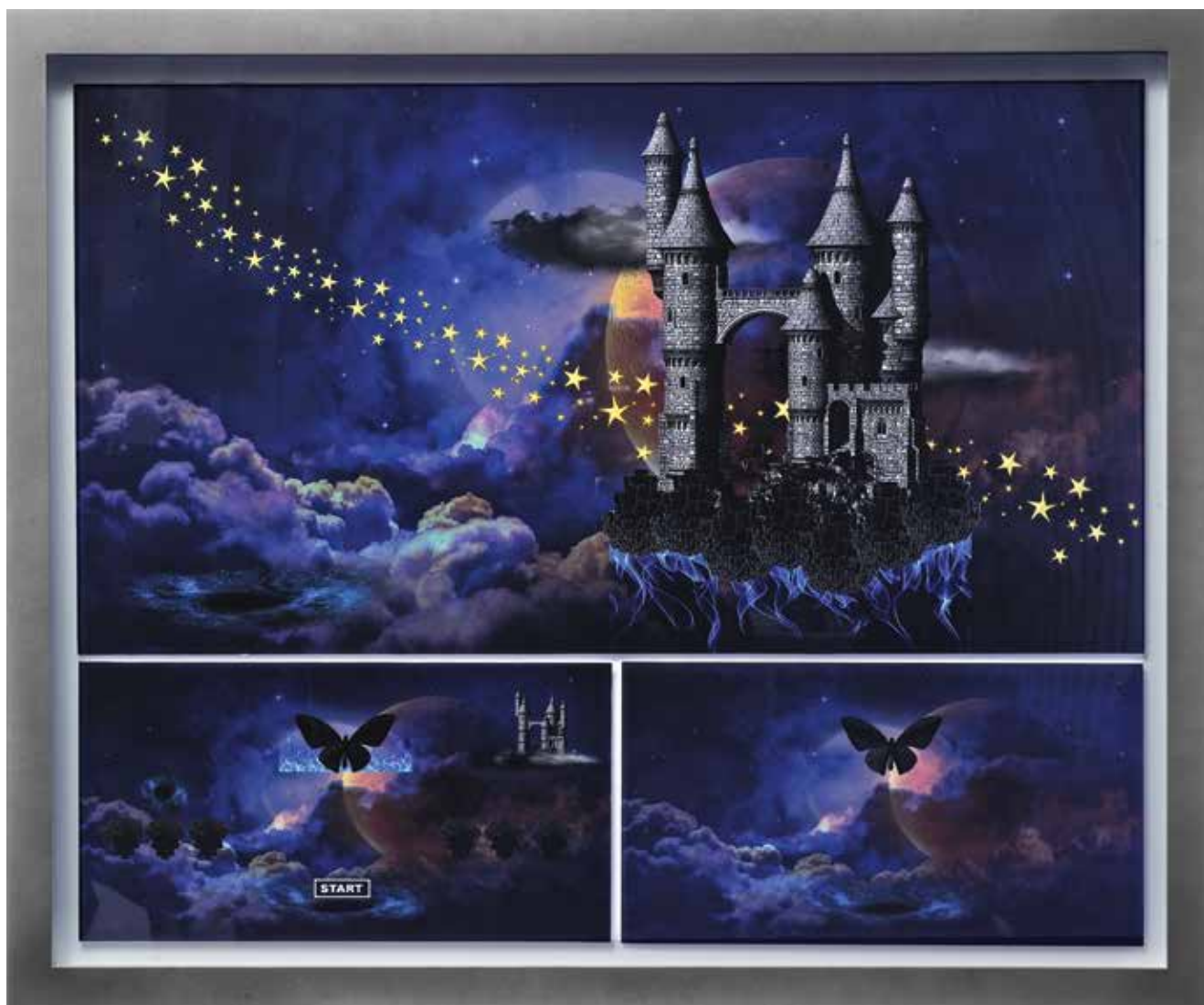
Hillary Rochon, Final Boss , 2019. Digital collage, 30 x 16 in.