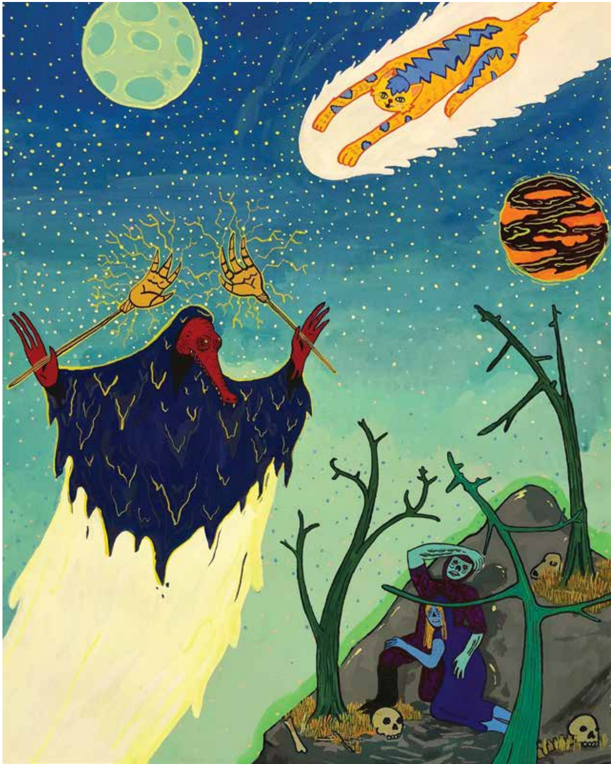
Bonner Sale, Troubled Magic: No Need for Conscience , 2018. Gouache on paper, 22 x 15 in.