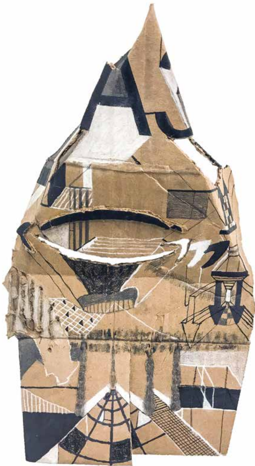
Nieko McDaniel, Untitled Landscape #9 , 2019. Archival pen, cardboard, graphite, Sharpie, white oil pencil, 11.5 x 6 x 3.5 in.