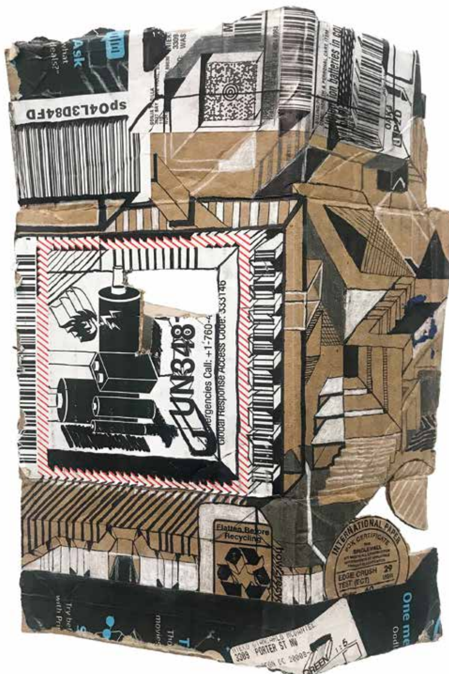
Nieko McDaniel, Untitled Landscape #6 , 2019. Archival pen, cardboard, graphite, Sharpie, white oil pencil, 12 x 7.5 x 2 in.