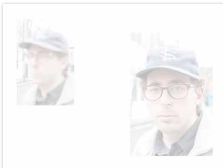
MichaelAngelo Rodriguez, Can you cook eel in the microwave , 2018. Archival pigment print, 13 x 19 in.