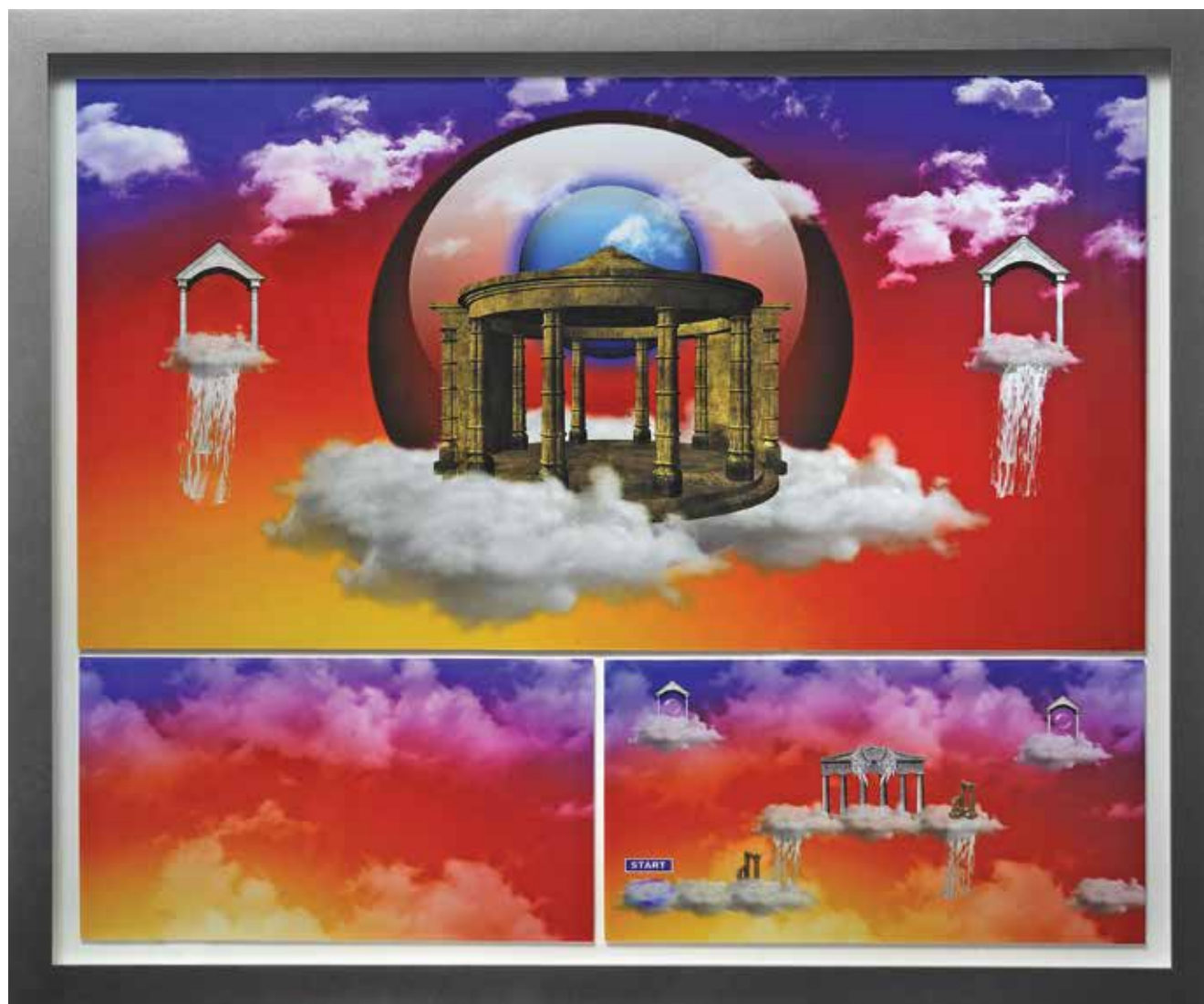
Hillary Rochon, Into Forever , 2019. Digital collage, 30 x 16 in.