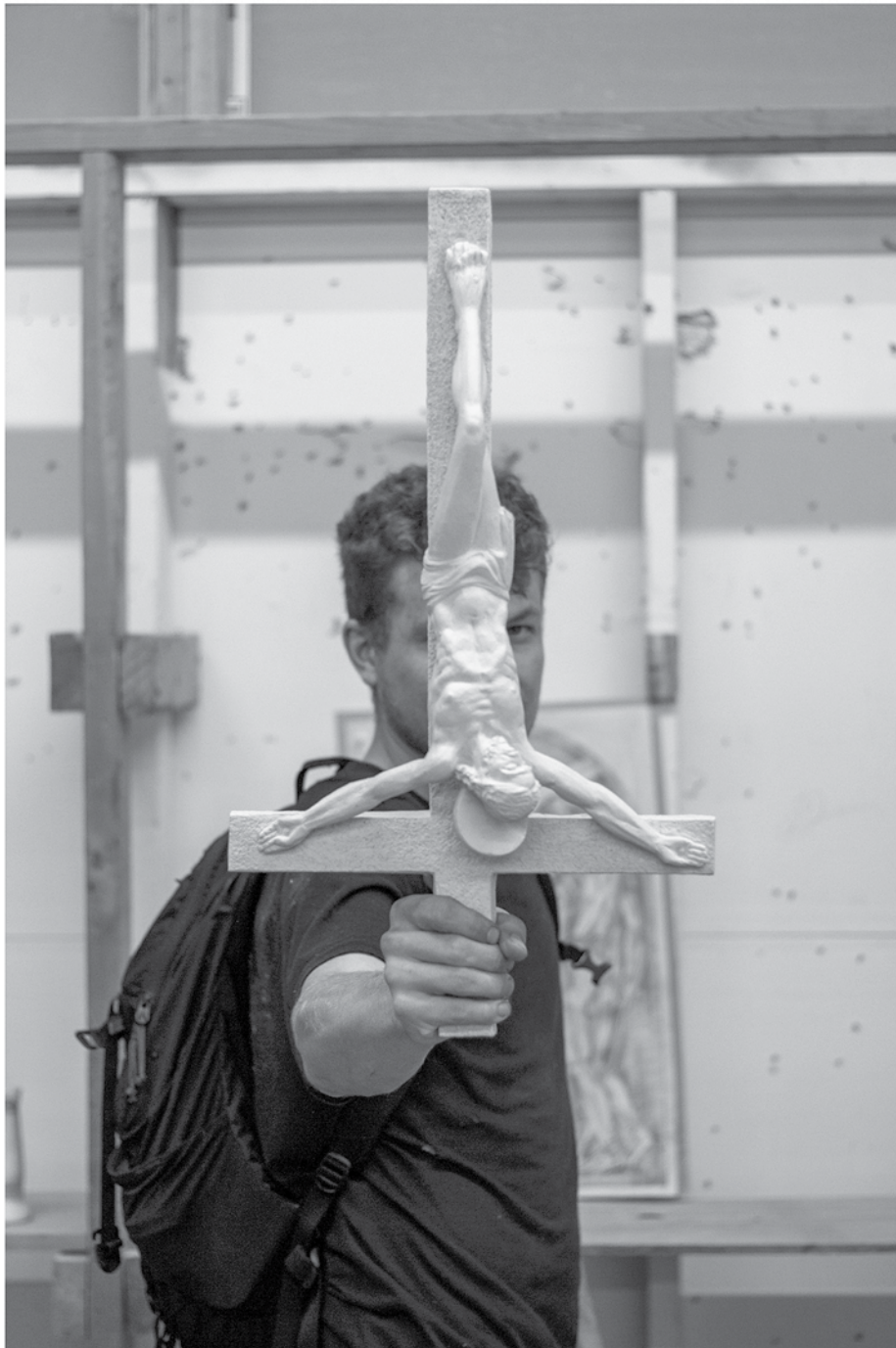
MichaelAngelo Rodriguez, The moment he turned it upside down , 2019. Archival pigment print, 19 x 13 in.