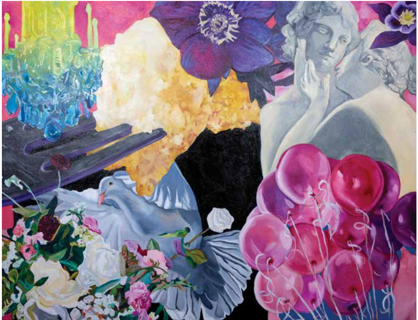
Corynne Ostermann, The Lovers , 2020. Latex and oil on canvas, 60 x 78 in.