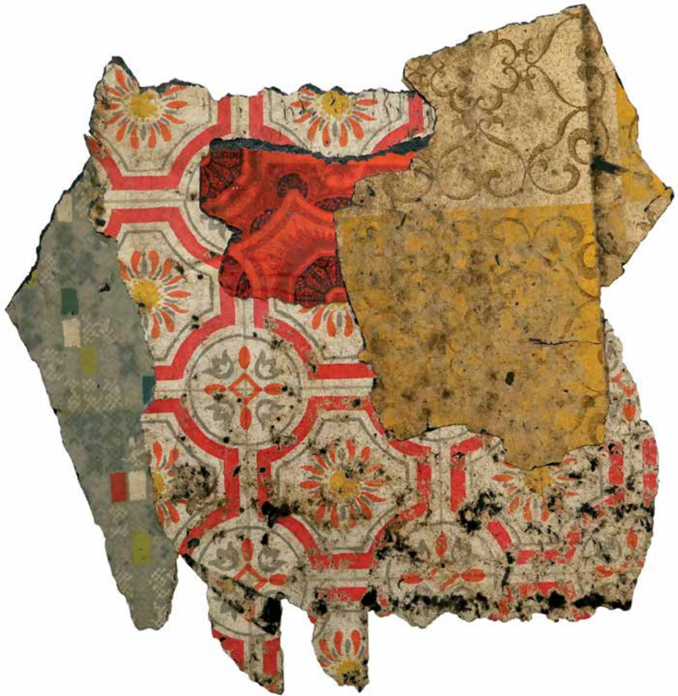
Chris Zickefoose, Atropos , 2017. Reclaimed laminate flooring on cut plywood, 22 x 22 in.