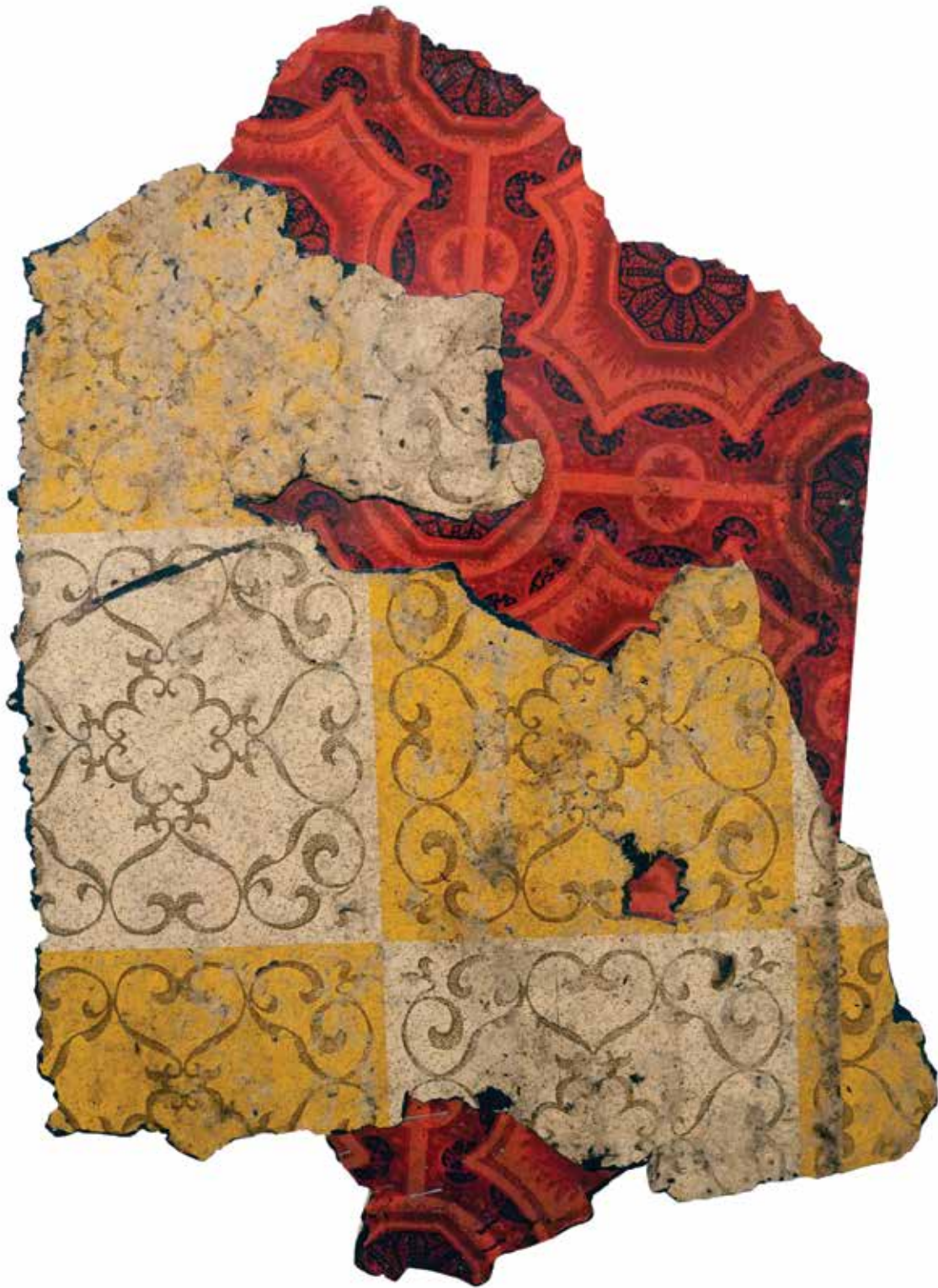
Chris Zickefoose, Lachesis , 2017. Reclaimed laminate flooring on cut plywood, 27 x 20 in.