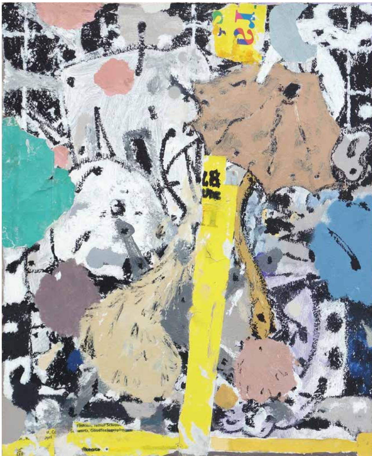
Jack Coyle, Club Feet , 2019. Acrylic on canvas, 24 x 18 in.

Page 10: Jack Coyle, Surveillance Gate , 2019. Mixed media, 18 x 12 in.; Page 11: Jack Coyle, Cannon , 2019. Mixed media, 22 x 15 x 15 in.