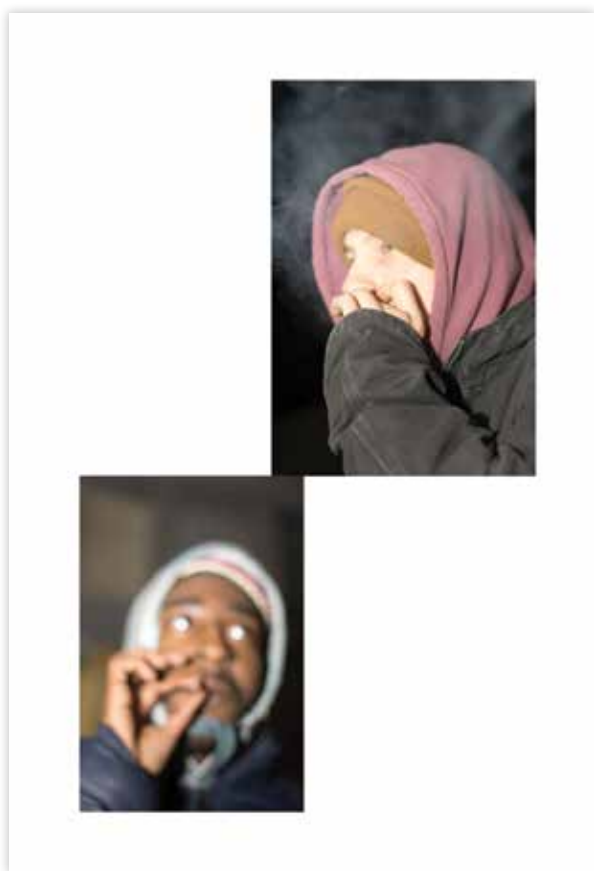
MichaelAngelo Rodriguez, Getting together to create , 2019. Archival pigment print, 19 x 13 in.